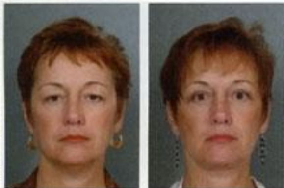
Brow lift with upper and lower eyelid surgery