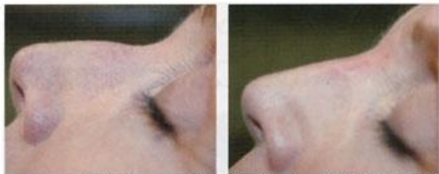
Straightening a nose using dermal filler (pictured immediately after the injection).

The nose is made up primarily of bone and cartilage, with the bone in the upper section and the cartilage below.